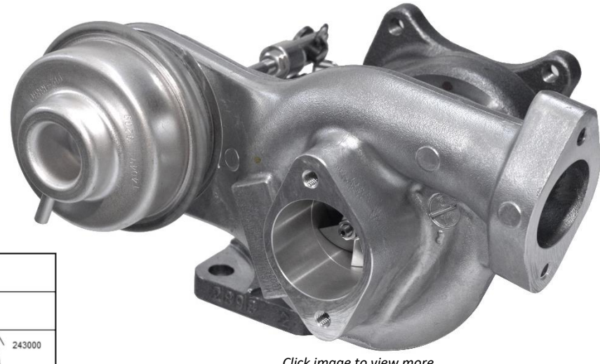
Click image to view more.